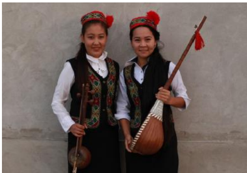
Musicians holding a girjek and dutar

jetigen : wooden zither of Kazakh origin with seven strings made of horsehair