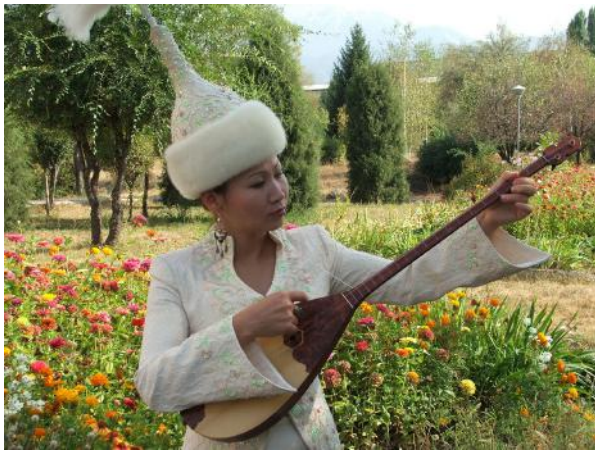
Contemporary female bard and her dutar