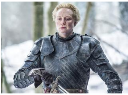
Brienne of Tarth (Gwendolyn Christie)

Other fictional stories of female fighters from 20th- and 21st-century popular culture include Wonder Woman, the quintessential female fighter. In the 2017 film Wonder Woman , many female athletes, martial artists and professional fighters were cast as Amazonian warriors. The director often had to tell them to “tone it down” as they brought their real-life fight training onto the set. Another popular series featuring female warriors is Game of Thrones . The characters of Brienne of Tarth, played by Gwendolyn Christie, and Arya Stark, played by Maisie Williams, both fight their way through the treacherous landscapes of Westeros, deftly wielding their swords.