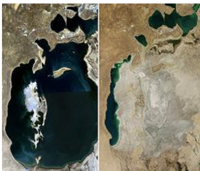
On the left, the Aral Sea in 1989; on the right, the sea as of 2014

though a mix of ethnicities is represented in each. Rule by the Soviet Union led to many changes in the area. The northwestern part of Uzbekistan was once dominated by the Aral Sea, which was fed by two rivers, Amu Darya and Syr Darya. In the 1960s, Soviet economic planners and engineers rerouted these rivers to provide crop irrigation. Once the fourth largest inland body of water in the world, it is now more desert than water—the eastern portion of the sea is entirely gone. What water remains has a high level of salinity; fishing is no longer able to support the region as it once did.