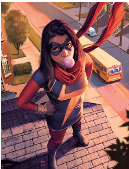
Ms. Marvel, Kamala Khan

The story of Gulayim resonates with accounts by Herodotus and other ancient historians of female warrior-rulers who belonged to the nomadic or “barbarian” cultures beyond the Black Sea. Among these is Tomyris, ruler of the kingdom of the Massagetae, whose territory was close to that of present-day Karakalpakstan. According to Herodotus, Tomyris led the Massagetaens in defending their land against Persian invaders.