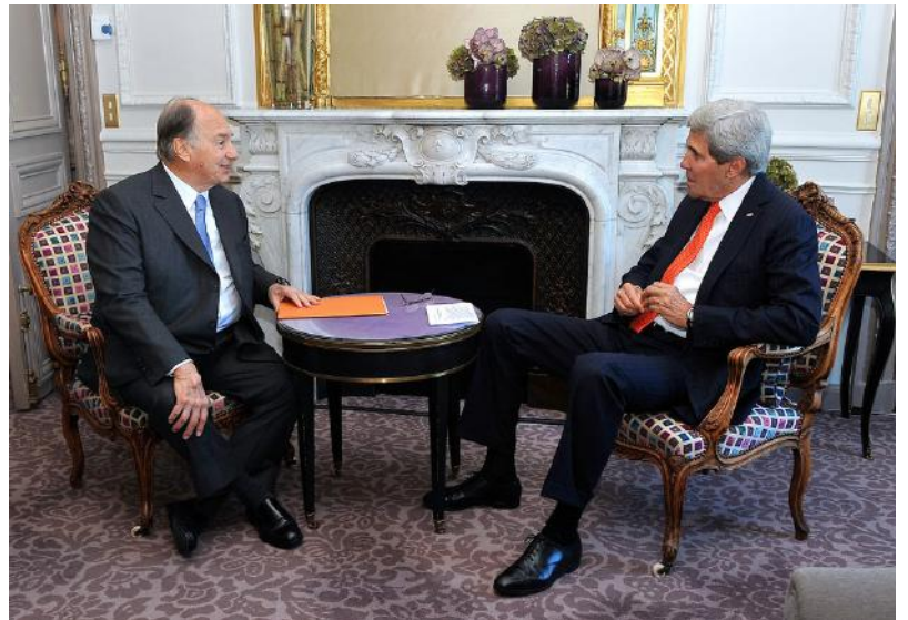
The Aga Khan meets with then Secretary of State John Kerry in 2014.

The Aga Khan Music Initiative is an interregional music and arts education program with worldwide performance, outreach, mentoring and artistic production activities. The Initiative was launched by His Highness the Aga Khan to support talented musicians and music educators working to preserve, transmit and further develop their musical heritage in contemporary forms. The Music Initiative began its work in Central Asia, with projects in Kazakhstan, Kyrgyzstan, Tajikistan and Afghanistan, and subsequently expanded its cultural development activities to include artistic communities and audiences in the Middle East and North Africa, South Asia and West Africa.